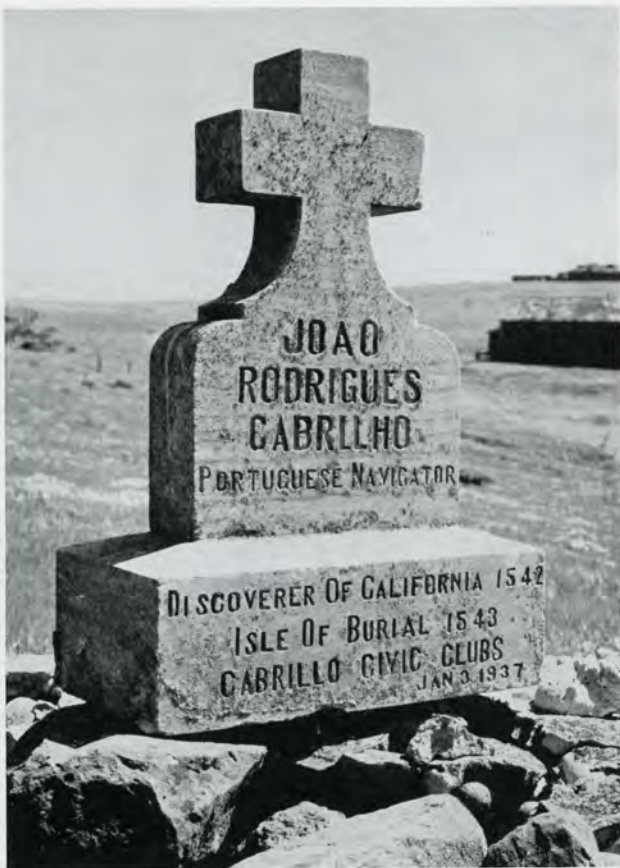
A cross on lonely San Miguel honors the discoverer of the Santa Barbaras, Juan Rodríguez Cabrillo, a Portuguese navigator who sailed under the Spanish flag. Many believe Cabrillo died on the island, but his burial place remains a mystery. The memorial follows the Portuguese spelling of his name.

The elephant seal gets its name from the